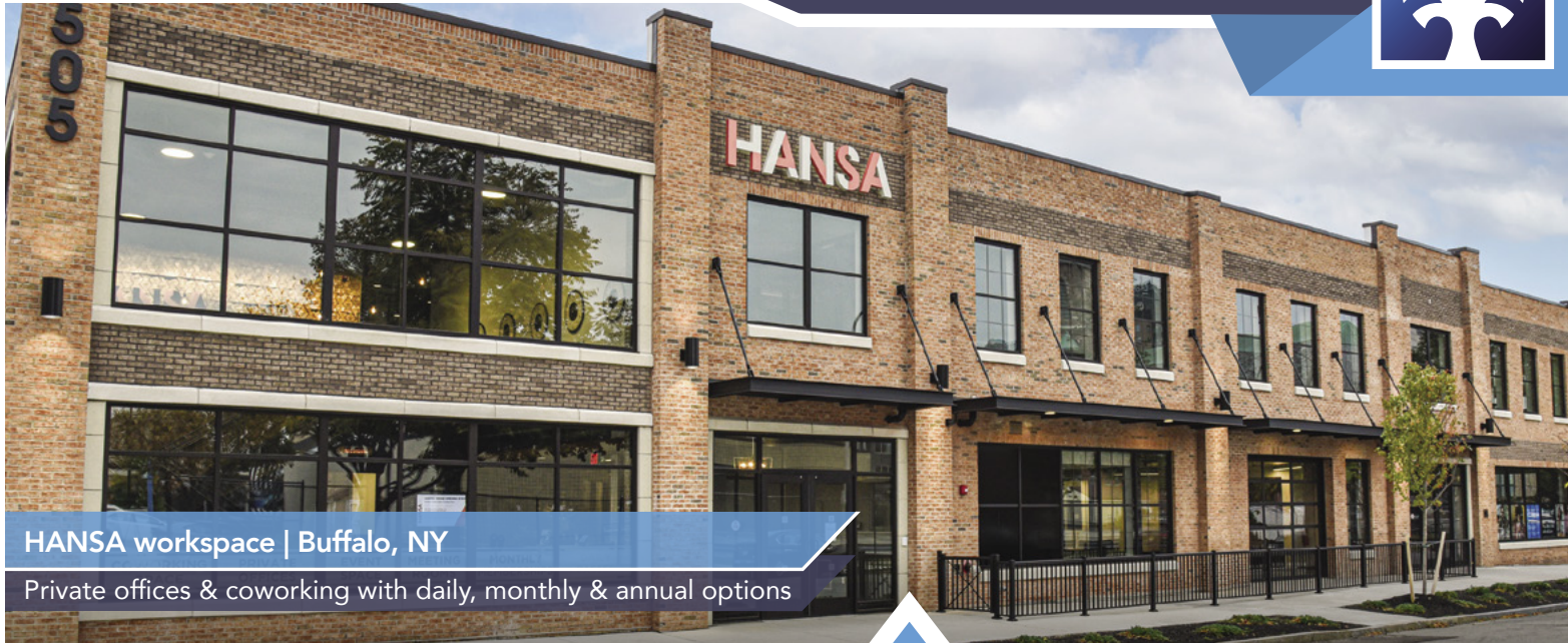
HANSA workspace | Buffalo, NY Private offices & coworking with daily, monthly & annual options

Whether you are a small business or a Fortune 500 firm, Uniland has the largest portfolio of office, industrial and flex space, and shovel-ready vacant land in the Buffalo region.