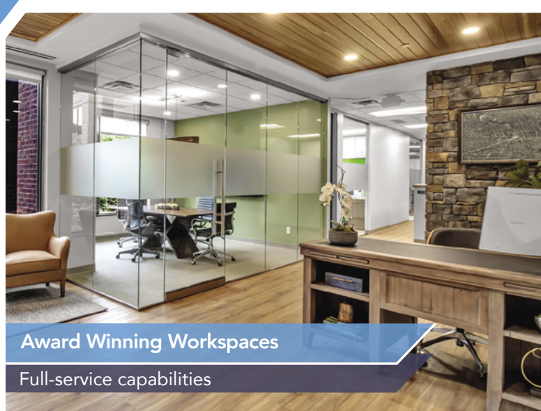
Award Winning Workspaces Full-service capabilities