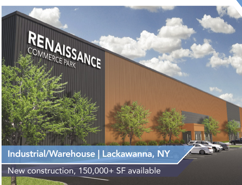
Industrial/Warehouse | Lackawanna, NY New construction, 150,000+ SF available

Whether you are a small business or a Fortune 500 firm, Uniland has the largest portfolio of office, industrial and flex space, and shovel-ready vacant land in the Buffalo region.